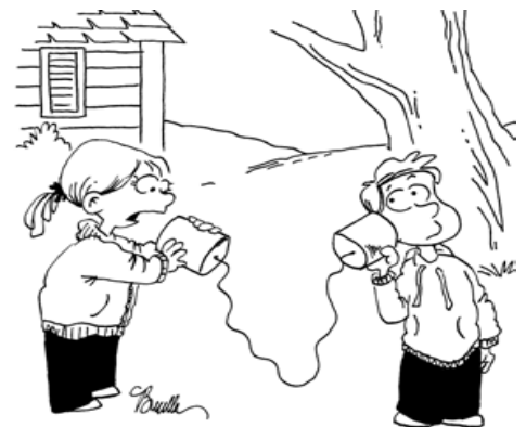
"How do you send text messages?"

"You look terrific." He doesn't want her to try on another outfit.